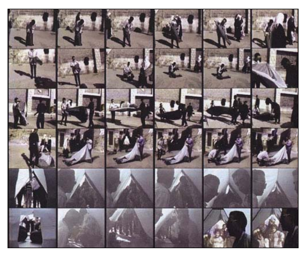
Figure 4. Jenny Marketou. Translocal: Camp in my Tent. Public Intervention in the Central Market Square, Ramallah (Palestine). Film Stills, 1998.