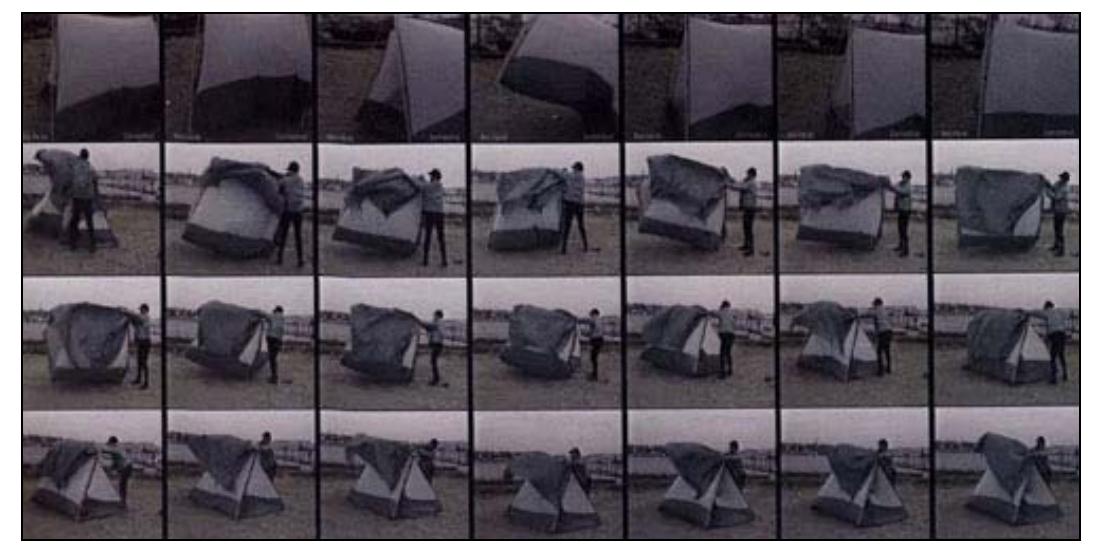
Figure 6. Jenny Marketou. Translocal: Camp in my Tent. Public Intervention near the Harbor in New London, Connecticut (US). Film Stills, 1998.