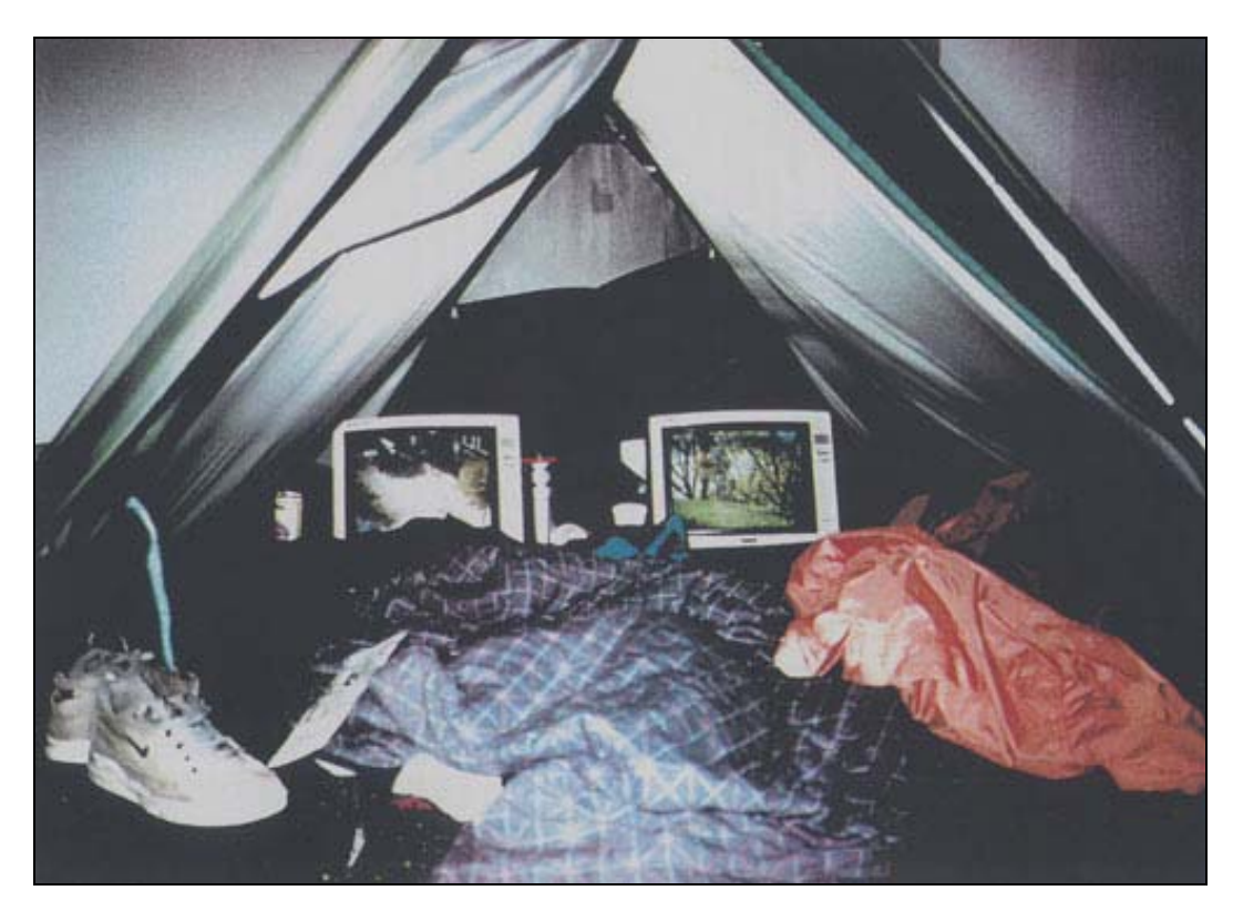
Figure 9. Jenny Marketou. Translocal: Camp in my Tent. Installation at the Witte de With Center for Contemporary Art, Rotterdam (Netherlands). 1996.

Foucault states that the design of this system "provide(s) an apparatus for supervising its own mechanism." Foucault argues that the ultimate purpose of the Panopticon is: