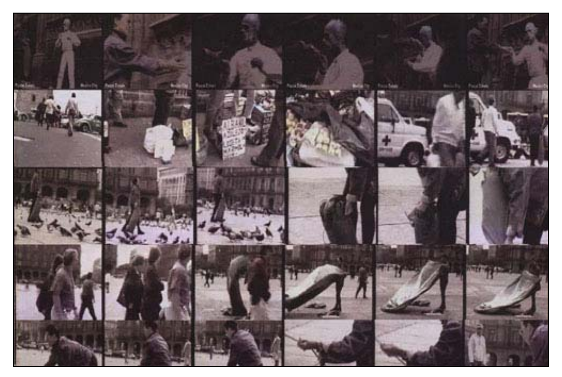
Figure 5. Jenny Marketou. Translocal: Camp in my Tent. Public Intervention in Piazza Zocola, Mexico City (Mexico). Film Stills, 1997.